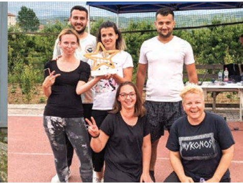
Team building: The annual coworker volleyball tournament raised funds for families in need.