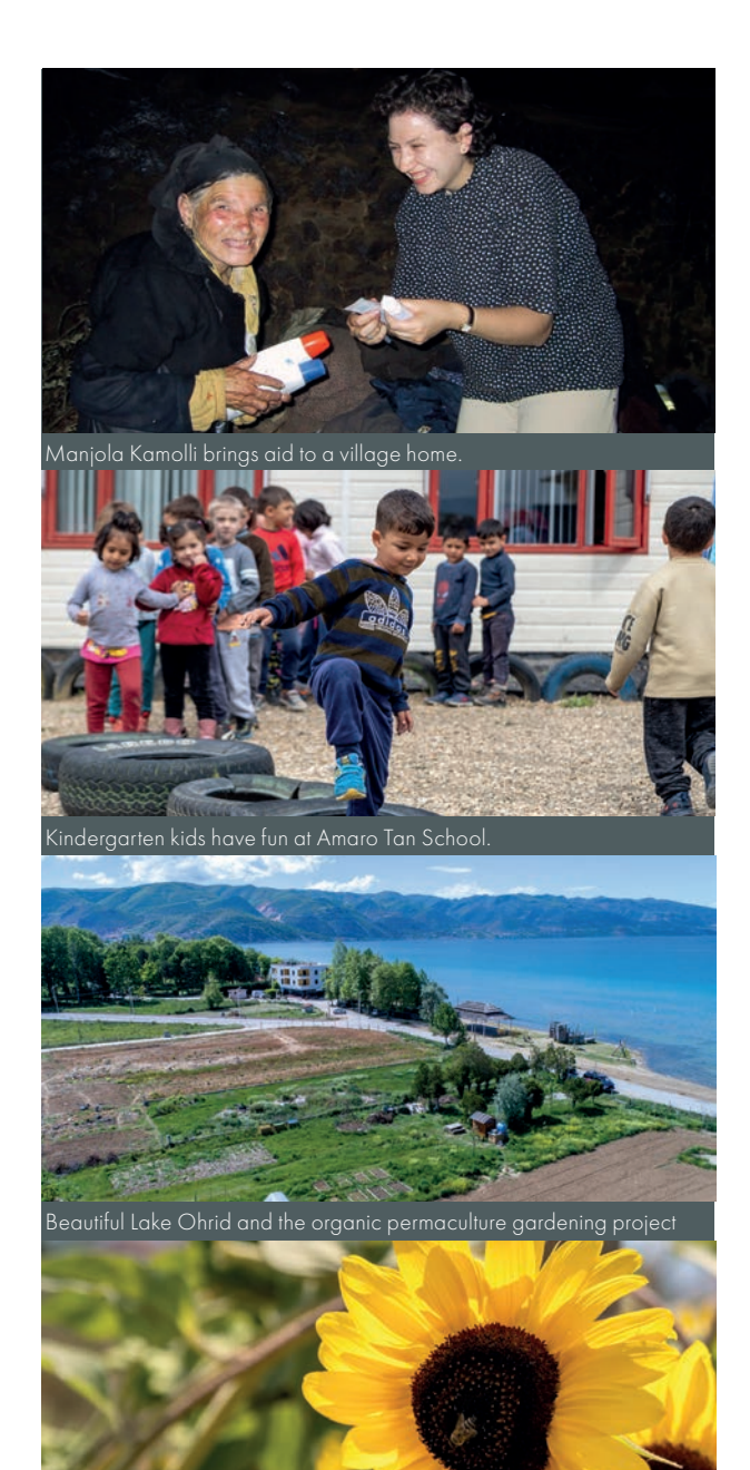
he sunflower - NG's symbol for growth and fruit

At thirty years, NG has established institutions on a foundation of honesty, inspiration, respect, forgiveness, compassion, and integrity. It has changed the lives of tens of thousands of people in Albania and beyond and continues to provide life-changing aid to thousands more every year. This is a small glimpse at a few of the volunteers, staff, and friends who have committed a part of their lives to this work. Visit, and you will meet many more. NG is a story about building sheltering walls and open doors, but most of all, it is a story about people.